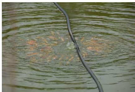
Koi feeding in one of the mud ponds