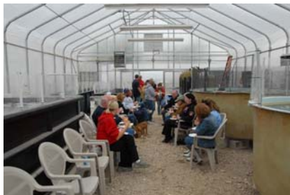
Enjoying lunch in one of the greenhouses.