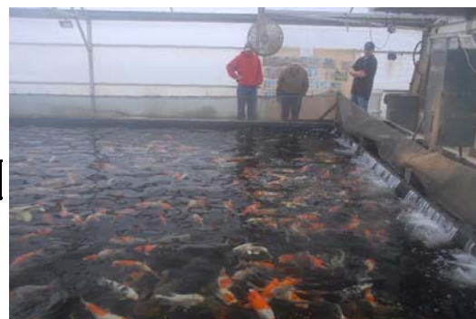
Just a few of the two year olds for sale