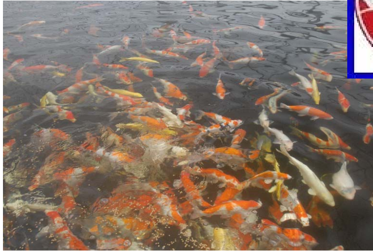
Mess' o' koi