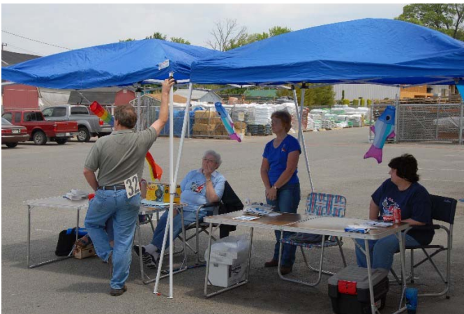
Working the booth at the last auction