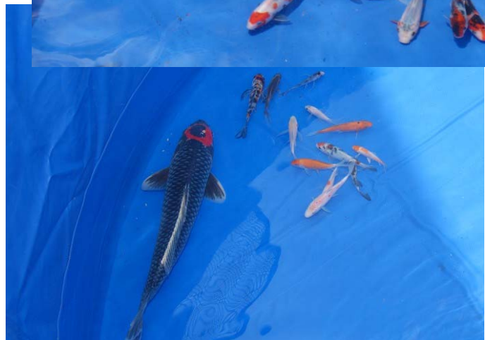
Some of last years auction koi