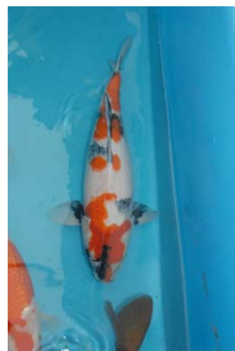
Kidai showa getting ready to go in the mud