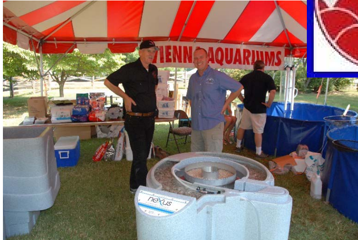
All photos in this months newsletter are from the 2007 Show